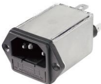
POWER ENTRY MODULE