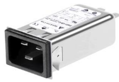
IEC EMI FILTERS