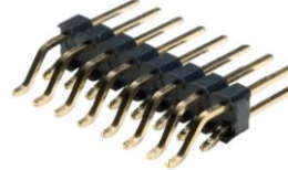
BOARD TO BOARD