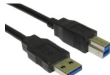
USB 2.0 / 3.0 / TYPE C