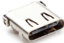
USB TYPE C