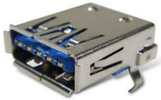
USB 2.0 / USB 3.0