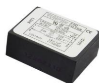
PCB EMI FILTERS